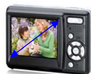
2.4" TFT LCD